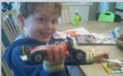
My Father's Day Present