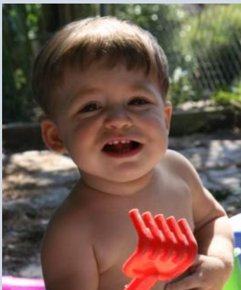
Enjoying the sandpit!