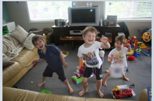
Our own little 'Boyband'!