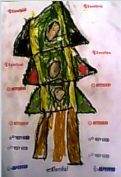
Micah's Christmas Tree