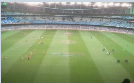
Swans V Blues @ Etihad Stadium